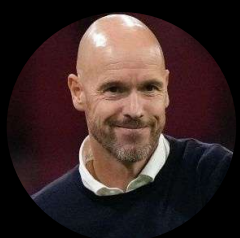
Erik ten Hag