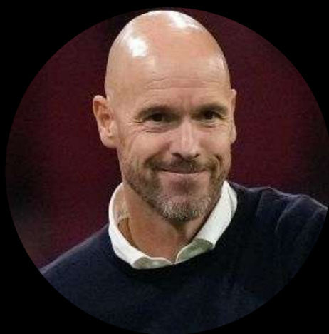
Erik ten Hag