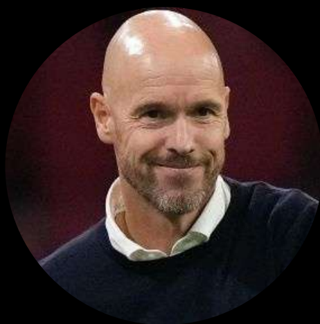
Erik ten Hag